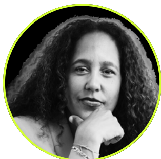
Gina Prince Bythewood