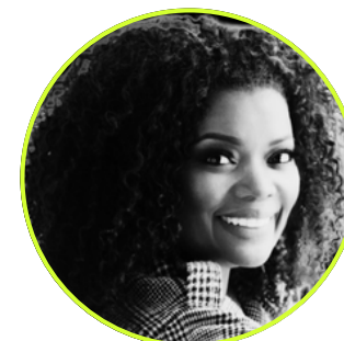
Yvette Nicole Brown