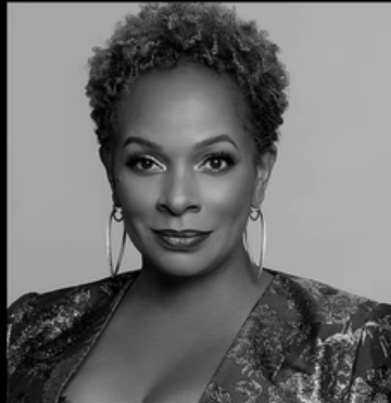
VANESSA BELL CALLOWAY