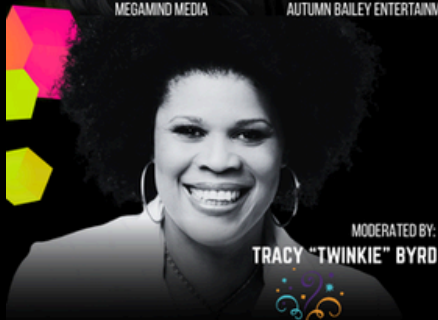
MODERATED BY: TRACY "TWINKIE" BYRD