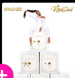
STACKED Album Artist: Kash Doll