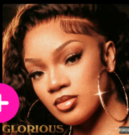
GLORIOUS Album Artist: Glorilla