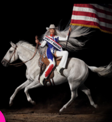
Cowboy Carter Album Artist: Beyoncé

TICKETS: Free (On Site Book Purchase Recommended)