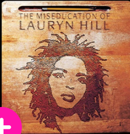
+ The Miseducation of Lauryn Hill Album Artist: Lauren Hill