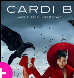
Am I The Drama? Artist: Cardi B