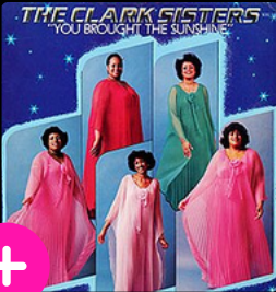
You Brought The Sunshine Album Artist: The Clark Sisters